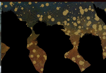
Why did the moon lose its brightness? by Teatro 220 (USA)

Legendary Spanish writer Miguel Cervantes and his ghostly companions join forces to help his titular character Don Quixote overcome challenges and find his way back home.