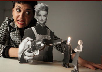
Paper Cut by Yael Rasooly (Israel)

An Indian from the village dreams of a supernatural woman. When he wakes up, he seeks advice from the village’s Pajé to try to understand the mysteries of this woman and discovers the story of lara.