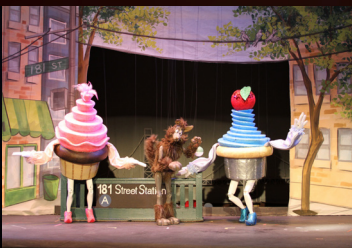
Little Red’s Hood by Swedish Cottage Marionette Theatre (USA)