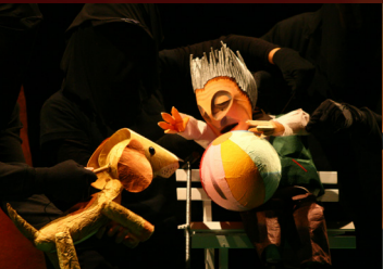
The Paper Play by Puppet Beings Theatre (Taiwan)