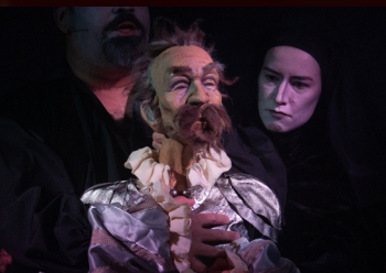
The Crazy Adventures of Don Quixote by Teatro SEA (USA)

A timid ghost, his skeleton father and a mysterious scarecrow have lots of laughs in this all-ages Halloween puppet show.