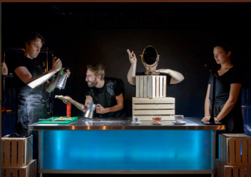
Sapientia by Scapegoat Carnivale (Canada)