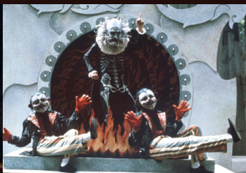
Barnacle Bill the Husband by Brendan Schweda (USA)