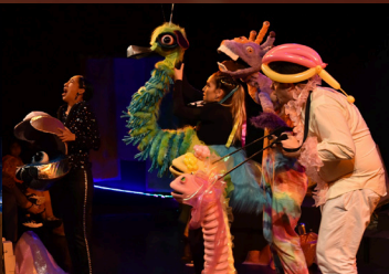
The Trip by Treasure Chest Theatre (Hong Kong)