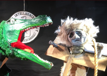
The Possession of Judy by Boxcutter Collective (USA)