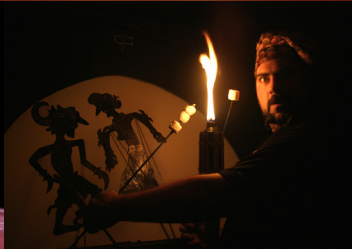
Spooky-Silly Sing-A-Long by Nappy’s Puppets (USA)