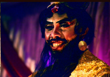
The Bearded Woman by Jei Fabiane (Colombia)