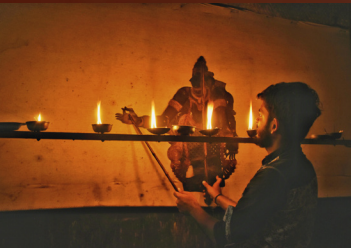
Ramayana by Tholpavakoothu & Puppet Centre (India)