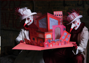
Road of Useless Splendor by Deborah Hunt/Maskhunt Motions (PR & NZ)