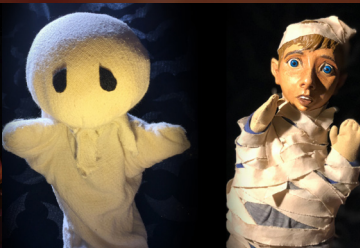
The Not-So-Spooky Ghost by WonderSpark Puppets (USA)

The award winning show, performed in over 30 countries, returns to NYC! A lonely secretary escapes into a world of daydreams. But as imagination and reality collide, her romantic tale becomes a Hitchcock nightmare!