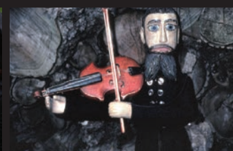
Salt Over Gold and other Czech & Slovak Fairy Tales With Strings by Czechoslovak-American Marionette Theatre