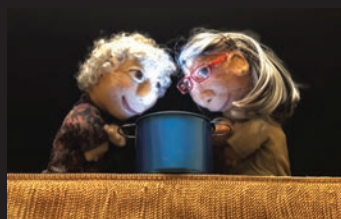
Chicken Soup, Chicken Soup by WonderSpark Puppets

A celebration of old age and a call to inclusiveness, with the aim of motivating and encouraging us to pay greater attention to the well-being of our seniors. Set to the backdrop of Boleros, Tangos, Mambos and the various musical genres from yesteryear.