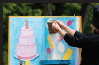
The Marzipan Bunny by A Couple of Puppets

A modern interpretation of Karagoz, literally Black-Eye, who is the hero of traditional Anatolian shadow play. The story of The Forest of the Witch is adapted from a play named The Bloody Tree of Turkish shadow theatre performer Muhittin Sevilen.