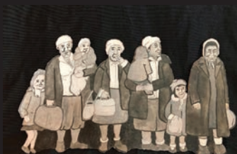
Once Upon a Time in the Lower East Side By Junktown Duende Collective

A magical masked creature is the caretaker of journeys. She operates a suitcase on legs connected to a large antenna, communicating with other creatures in her world. Her story is one of compassion in troubling times.