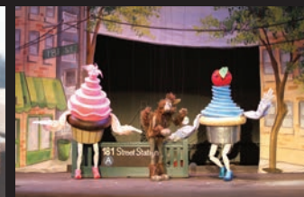
Little Red's Hood by Swedish Cottage Marionette Theatre