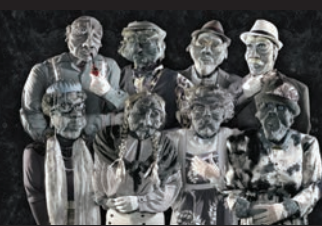
Los Grises/The Gray Ones by Teatro SEA

A celebration of old age and a call to inclusiveness, with the aim of motivating and encouraging us to pay greater attention to the well-being of our seniors. Set to the backdrop of Boleros, Tangos, Mambos and the various musical genres from yesteryear.