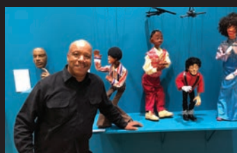
Harlem River Drive by Bruce Cannon

A fresh retelling of the classic "Little Red Riding Hood" tale updated with a modern sensibility that appeals to kids.