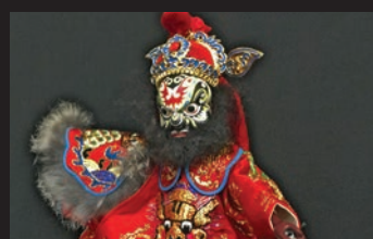
Triple Zhongkui Pageant by Chinese Theatre Works