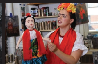
The Colors of Frida by Teatro SEA