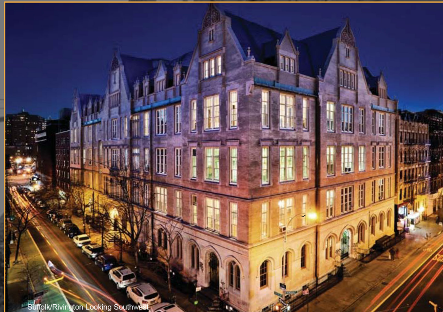
Suffolk/Rivington Looking Southwest